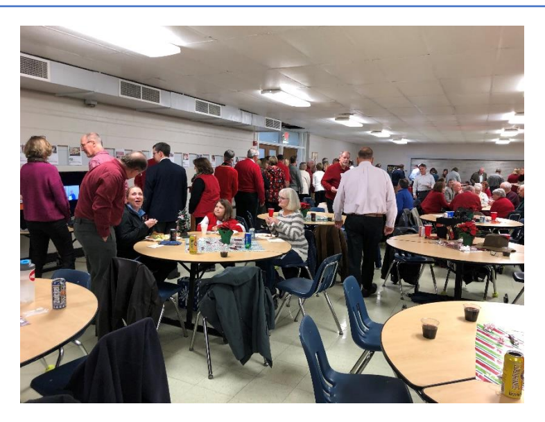
Folks in line for the food