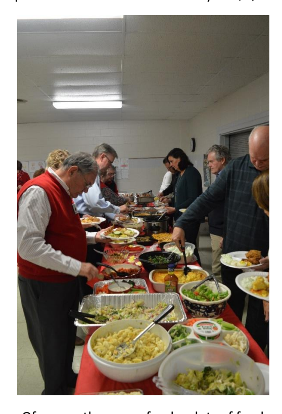
Of course there was food..... lots of food